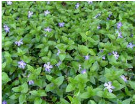
Pg 11 Big Periwinkle