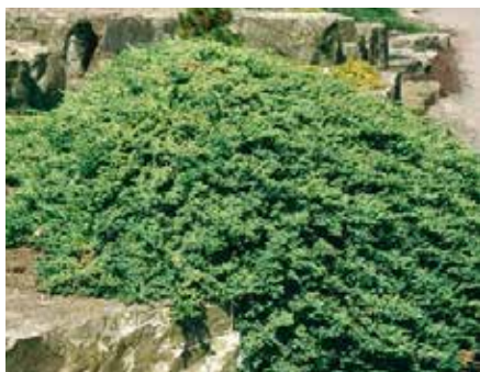
Pg 11 Japanese Garden Juniper