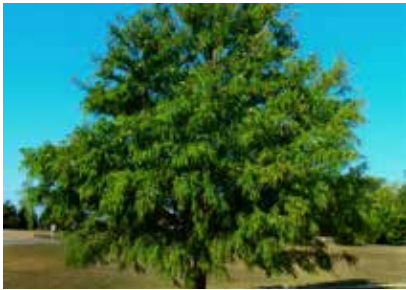
Pg 17 Common Bald Cypress