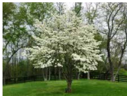
Pg 15 Rough-Leaf Dogwood