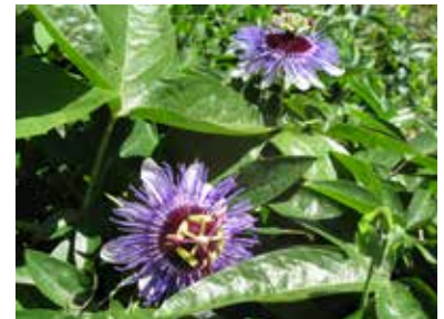
Pg 6 Passionflowers