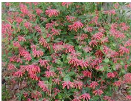
Pg 11 Coral Honeysuckle