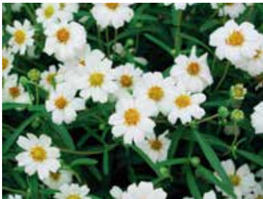
Pg 4 Blackfoot Daisy