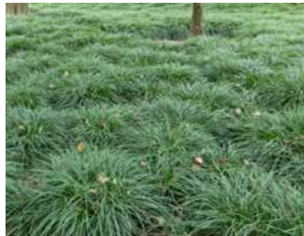
Pg 9 Monkey Grass