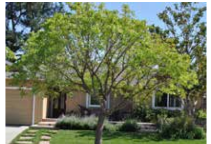
Pg 19 Chinese Pistachio