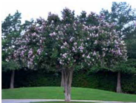
Pg 14 Common Crape Myrtle