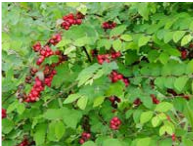
Pg 4 Coralberry