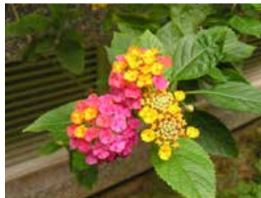
Pg 5 Lantana