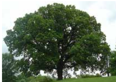
Pg 18 Bur Oak