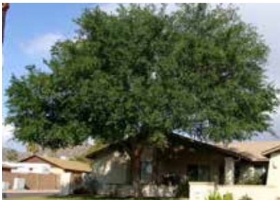
Pg 17 Lacebark Elm