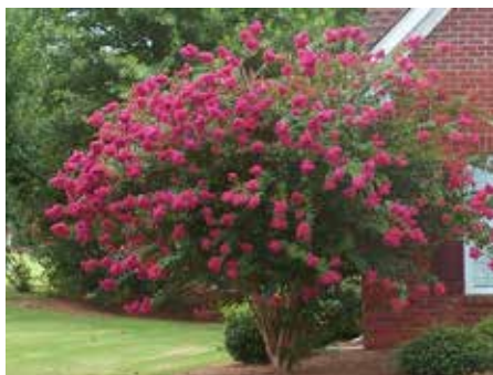
Pg 14 Copperbark Crape Myrtle