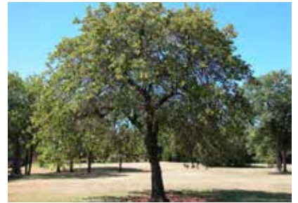
Pg 19 Post Oak