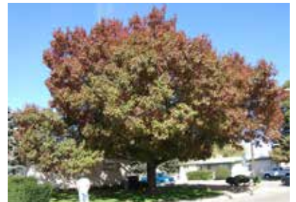
Pg 19 Texas Red Oak