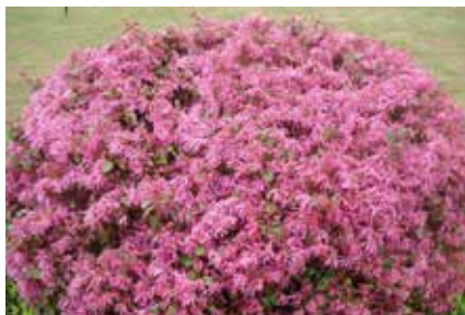
Pg 8 Chinese Fringe Flower