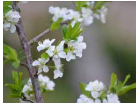
Pg 15 Mexican Plum