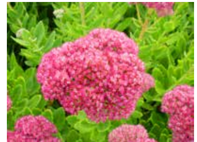
Pg 6 Stonecrop Sedum