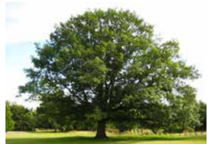
Pg 19 Shumard Oak