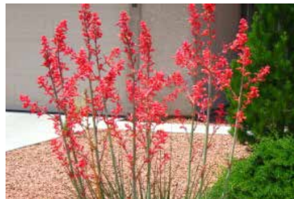
Pg 9 Red Yucca