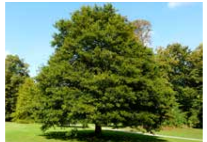
Pg 19 Willow Oak