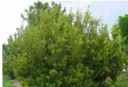
Pg 9 Dwarf Wax Myrtle