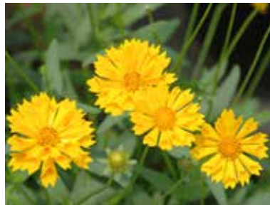
Pg 5 Lanceleaf Coreopsis