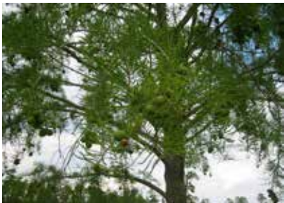
Pg 17 Pond Cypress