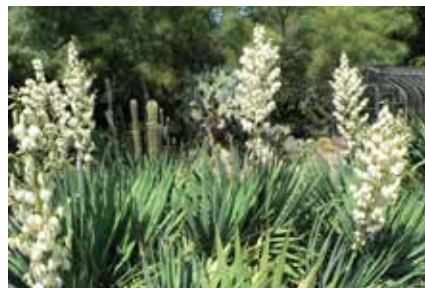
Pg 9 Yucca