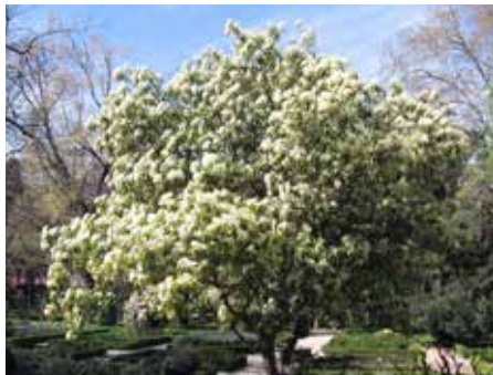
Pg 14 Chinese Photinia