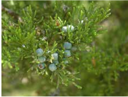
Pg 14 Ashe Juniper