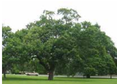
Pg 18 Chinkapin Oak