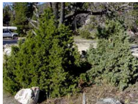
Pg 15 Rocky Mountain Juniper