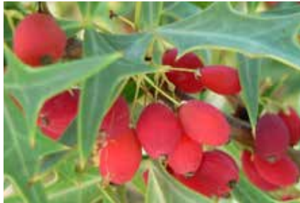
Pg 8 Agarito