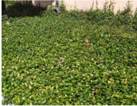
Pg 11 Asian Jasmine