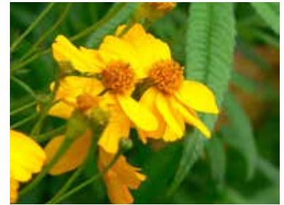
Pg 6 Mexican Mint Marigold