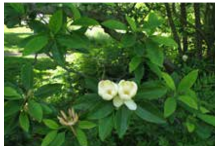
Pg 9 Sweetbay Magnolia