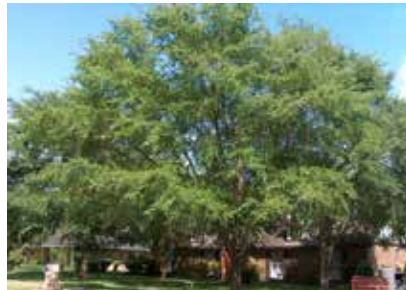
Pg 18 Winged Elm