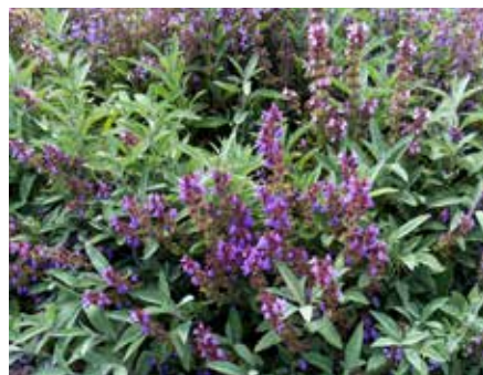
Pg 9 Salvia/Sage