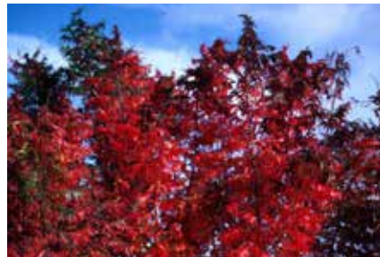
Pg 9 Prairie Flameleaf Sumac