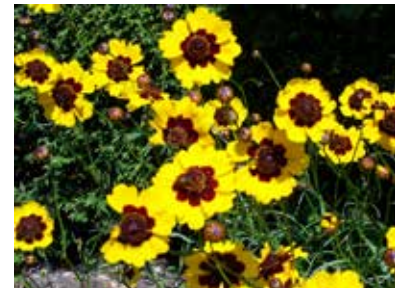
Pg 6 Plains Coreopsis