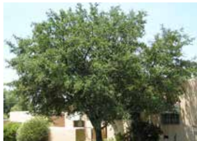
Pg 18 Escarpment Live Oak