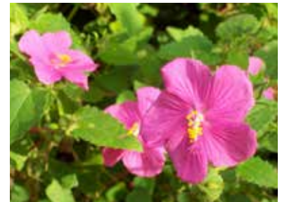
Pg 6 Rockrose