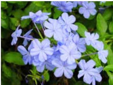
Pg 4 Blue Plumbago