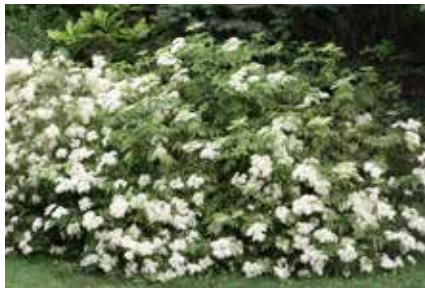
Pg 8 American Elderberry