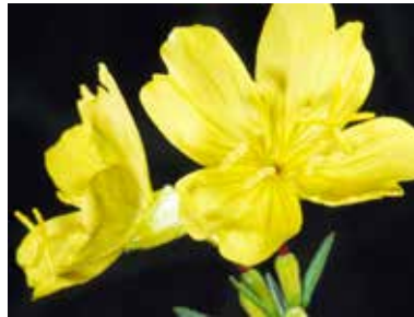
Pg 5 Evening Primrose