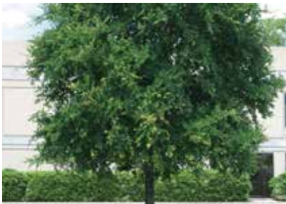
Pg 17 Cedar Elm