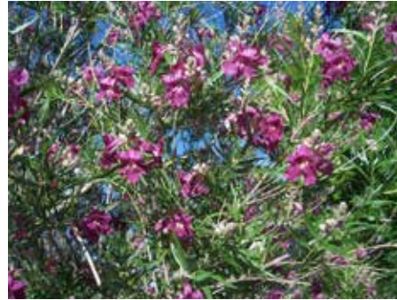
Pg 15 Desert Willow