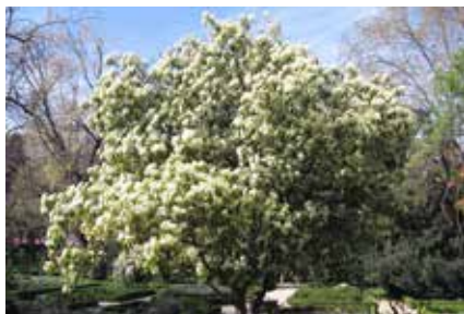
Pg 8 Chinese Photinia