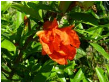
Pg 4 Dwarf Pomegranate