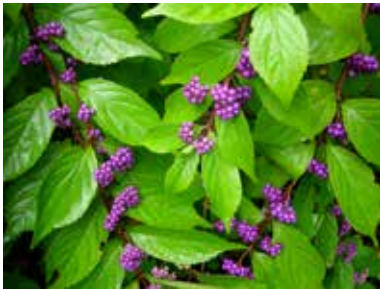
Pg 4 American Beautyberry