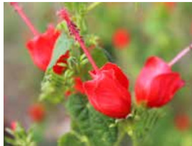
Pg 5 Giant Turk's Cap