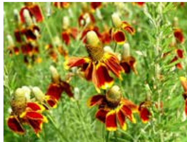
Pg 5 Mexican Hat