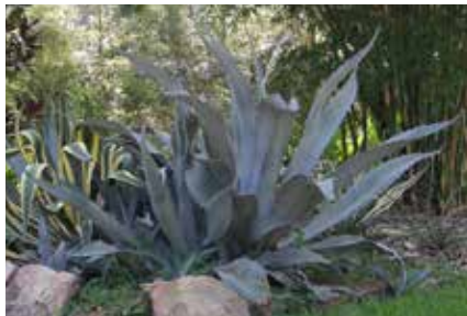
Pg 8 Century Plant