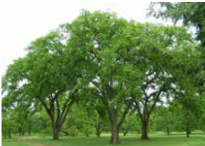
Pg 17 American Elm