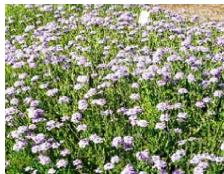
Pg 9 Verbena