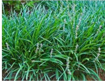
Pg 9 Liriope