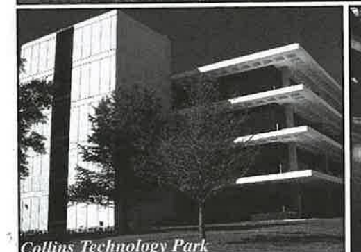
Collins Technology Park