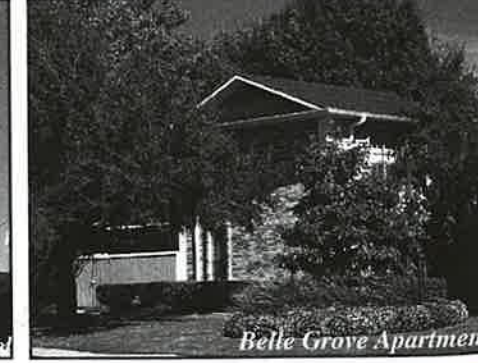
Belle Grove Apartments