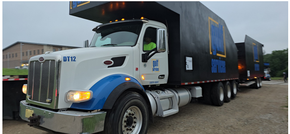
Above, a debris hauling vehicles gets ready to move into neighborhoods to start the weeks-long work of picking up storm-related vegetative debris.