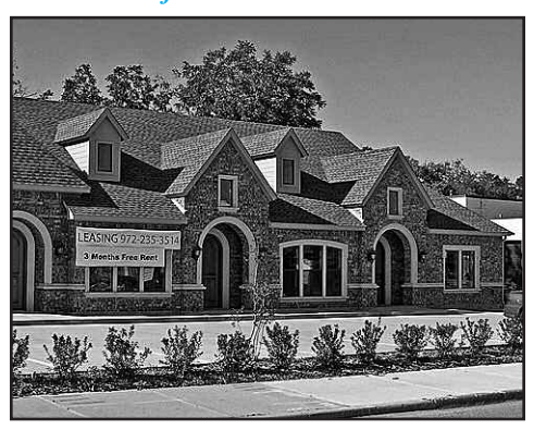
Threadgill Office Building