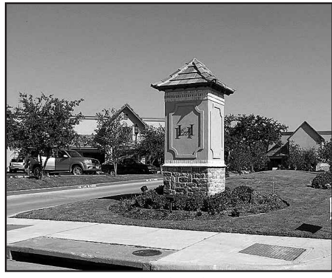
II Creeks Plaza