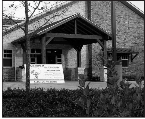
The Warren Center