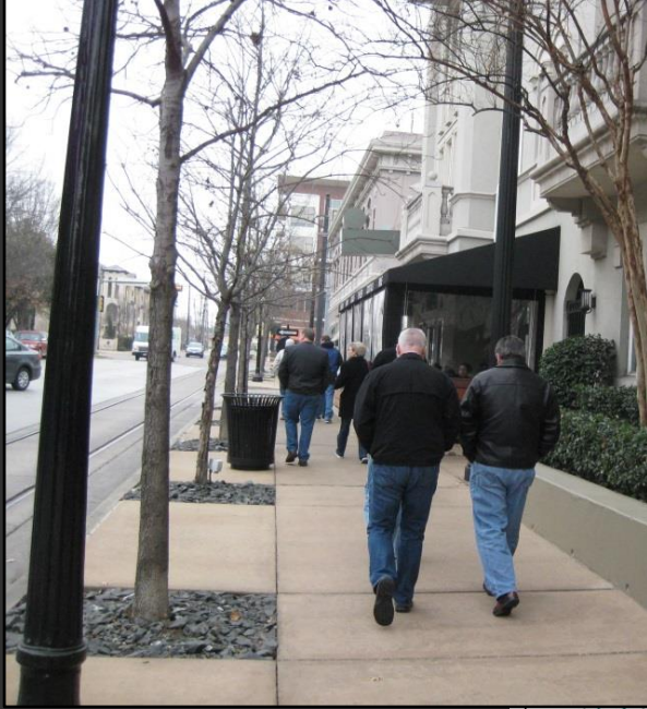
Building Heights — West Village