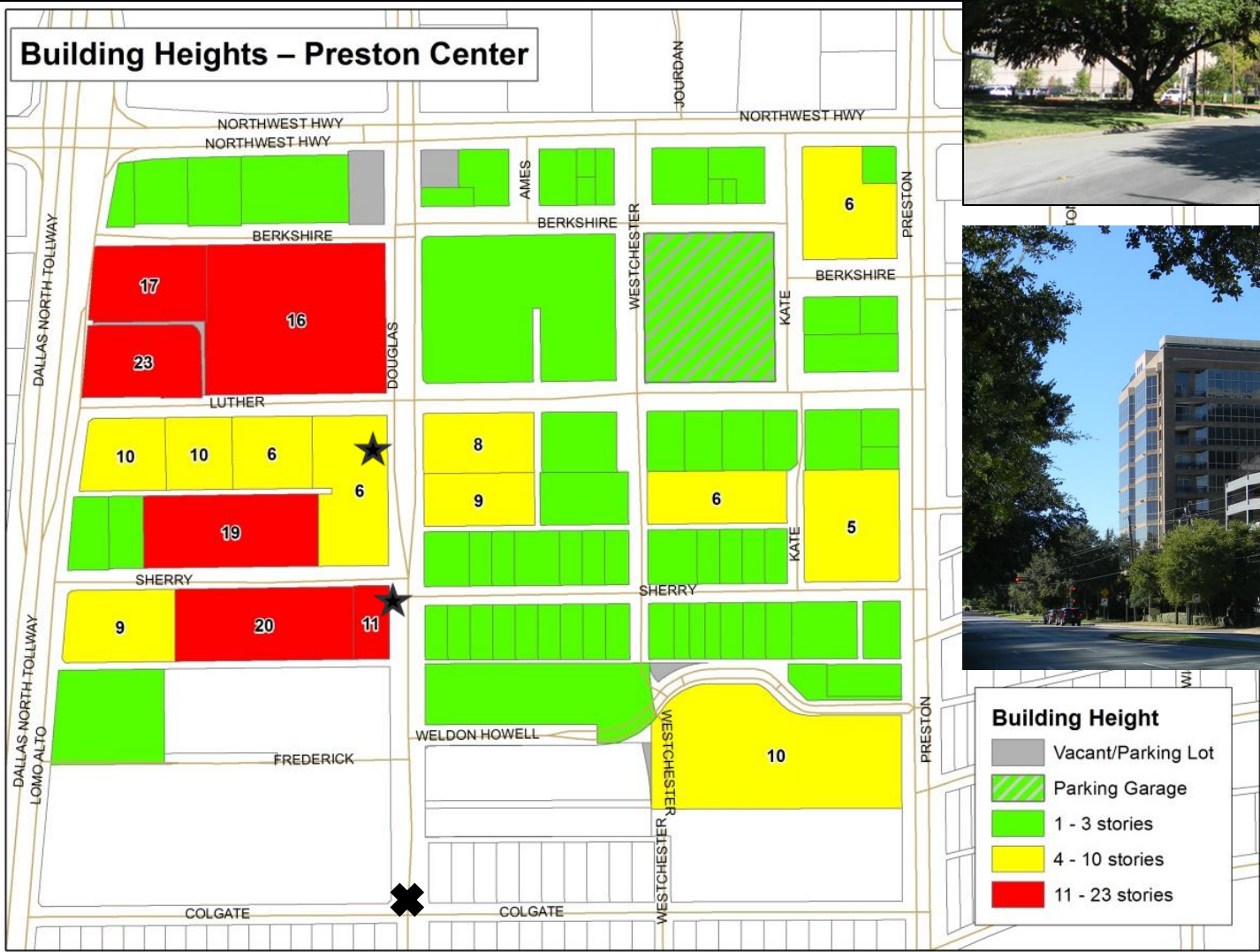
Building Heights – Preston Center